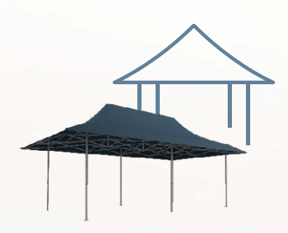
Automatic Awnings | From $2,550

An added touch of elegance, scalloped valances make a refined addition to your tent.