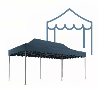
Scalloped Valances | +$75

An added touch of elegance, scalloped valances make a refined addition to your tent.